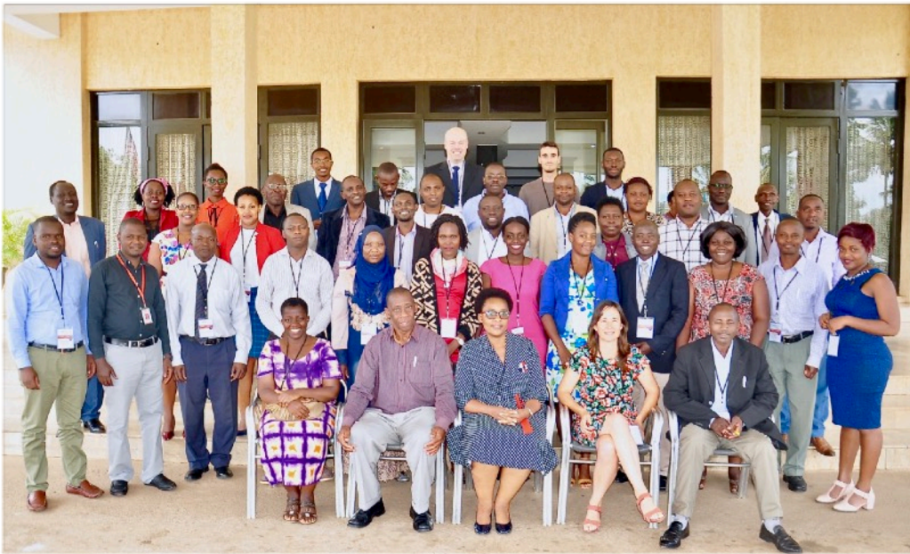
Kick off meeting september 2019, Mbarara.

Action Towards Reducing Aquatic snail-borne Parasitic diseases