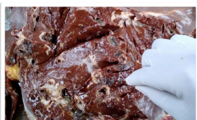
Cow liver highly infected with liver flukes in Kagadi abattoir