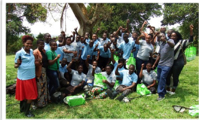
The entire citizen scientist team at the training in March 2020

All this information will be used to design contextualised communication tools that will be used during the snail-borne diseases awareness interventions in 2021.