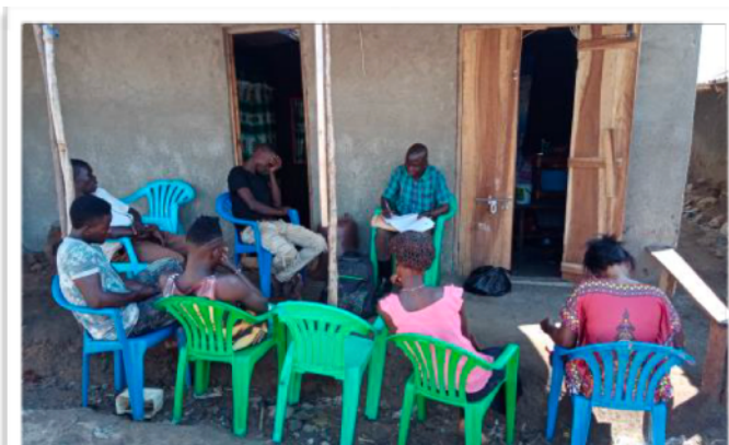
Focus group discussion in Ndaiga sub-county